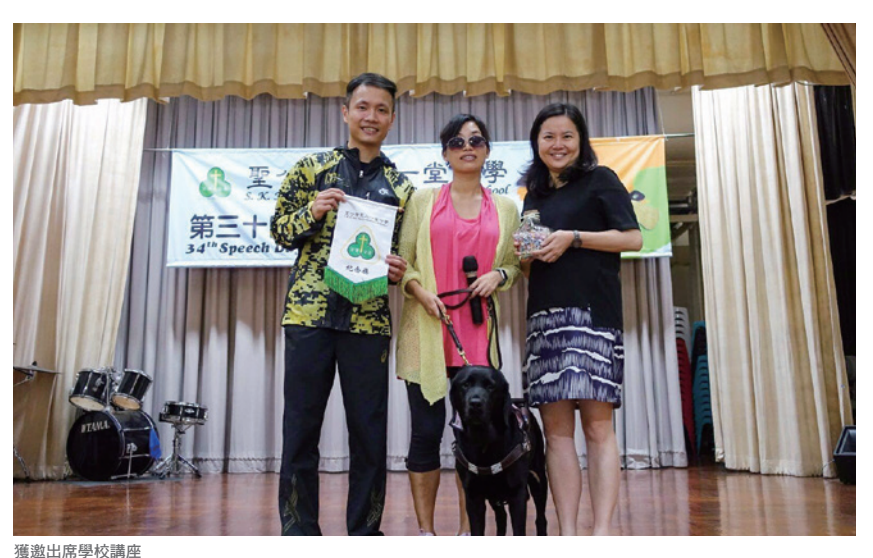
獲邀出席學校誦脞 Fu was invited to be the guest speaker in a school

u was diagnosed with chronic glaucoma with myopia of -20 diopters at 16. Despite extended medication therapy and surgical intervention, she eventually became totally blind at the age of 26. Her visual disability resulted in unemployment. "My father