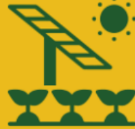
SOLAR BASED ENERGY PROJECTS