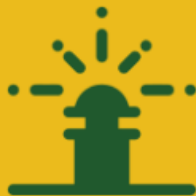
PIPELINE BASED IRRIGATION SYSTEM PROJECTS