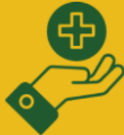
VALUE ADDITION PROJECTS