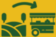
FARM TO MARKET - ROAD PROJECTS