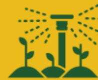
HIGH EFFICIENCY IRRIGATION SYSTEM PROJECTS