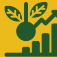
AGRI-INVESTMENT/ INSURANCE PROJECTS