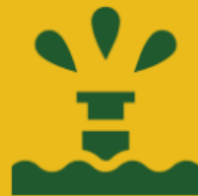
CANAL BASED IRRIGATION SYSTEM PROJECTS