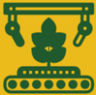
FARM MECHANIZATION PROJECTS