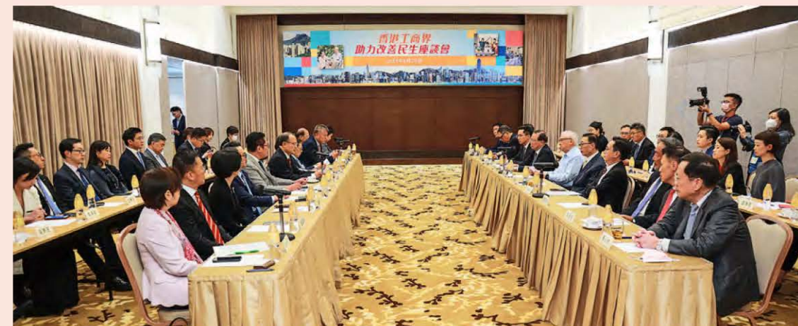
▲ 香港工商界助力改善民生座談會 Symposium on the Hong Kong business community helping to improve people's livelihood

另外，本會歡迎《財政預算案》既重點扶持受疫情影響的中小企和基層市民，亦勾勒疫後振興經濟具體發展藍圖，通過深化推進與內地及海外聯繫、積極投資未來、聚焦高質量發展，為增強香港發展動能、提升整體競爭力作長遠佈局。《施政報告》及《財政預算案》發表後，本會聯同各大商會合辦午餐講座，分別邀請行政長官及財政司司長闡釋其施政及財政要旨，讓工商界更了解政府的施政方向。(16/11 & 16/3)