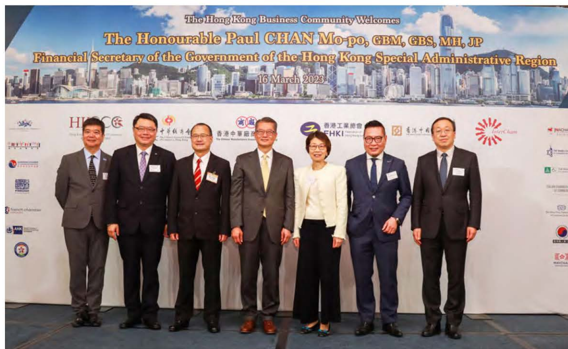
▲ 財政司司長陳茂波（中）介紹財政預算案的具體措施 Financial Secretary Paul Chan (middle) expounds measures in the Budget

In his second Policy Address, Chief Executive John Lee proposed multiple measures, including consolidating and further advancing the development of Hong Kong's eight centers, deepening regional economic and trade cooperation, and implementing targeted strategies in investment attraction, talent recruitment and development. Additionally, he also introduced specific measures to support various areas such as small and medium-sized enterprises, land and housing, elderly care and poverty alleviation, and youth development.