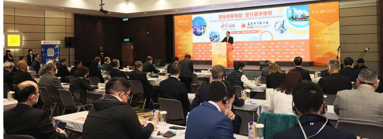
▲ 中總論壇吸引近 500 位嘉賓出席 CGCC Forum attracted nearly 500 guests

On the polling day of the new District Council elections, the Chamber's members actively participated in voting. Prior to the polling day, the Chamber set up street stations outside the CGCC Building for five consecutive days to distribute leaflets to call on the public to vote actively. The Chamber's Office-Bearers and members also participated in the publicity campaign during this period. (4-8 & 10/12)