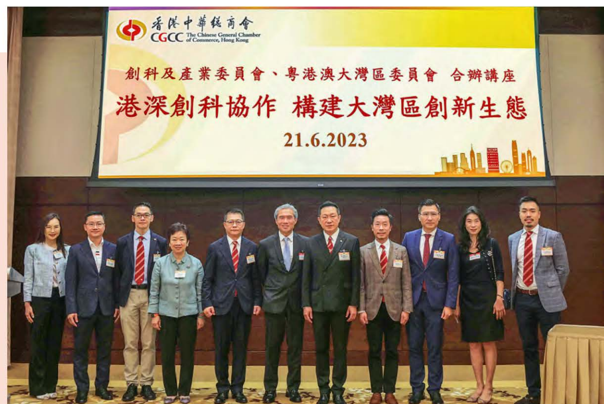
▲ 介紹港深創新及科技園講座 Seminar to introduce the Hong Kong-Shenzhen Innovation and Technology Park

“CGCC Cup” was held at Happy Valley Racecourse. The Chamber held banquets to gather consuls general in Hong Kong, representatives of chambers of commerce and members of the Chamber to enhance exchanges and communication, and to watch the horse racing events to experience Hong Kong's unique culture. (1/11)