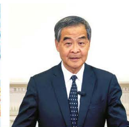
▲ 梁振英 CY Leung