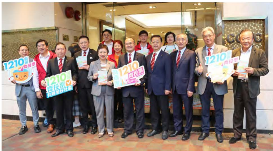
▶ 本會呼籲市民於區議會選舉積極投票 The Chamber distributes leaflets to call on the public to vote actively in District Council elections