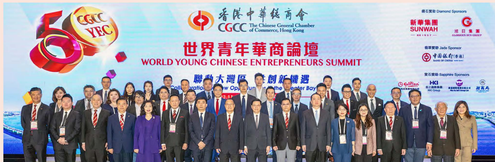
◀ 世界青年華商論壇吸引來自內地、澳門及海外多家青年華商代表團成員等逾300人出席 The World Young Chinese Entrepreneurs Summit attracts over 300 attendees, including representatives from Mainland China, Macao and various overseas youth Chinese business delegations