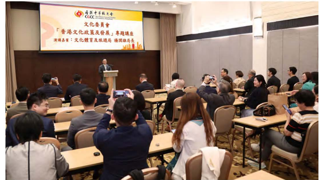
▲ 楊潤雄 Kevin Yeung