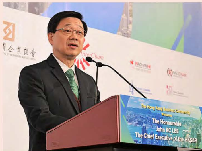
◀ 行政長官李家超向工商界闡釋《施政報告》要旨 Chief Executive John Lee explains his Policy Address to the business community

年內，行政長官李家超發表其任內第二份《施政報告》。報告涵蓋鞏固和持續推進香港“八大中心”發展、深化區域經貿合作等相關政策，在招商引資、引才育才等多方面提出針對性部署，並為支援中小企、土地房屋、安老扶貧、青年發展等不同範疇推出多項具體措施。