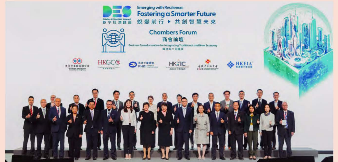
▲ 是年互聯網經濟峰會—商會論壇以“締造新二元經濟”為主題 This year's Internet Economy Summit - Chamber's Forum with the theme of "Business Transformation for Integrating Traditional and New Economy"