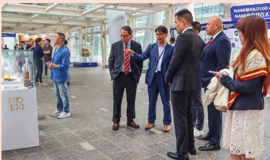
▶ 參觀科技產品展，了解全球科技研發商品化成果 Visit the technology product exhibition to learn about global technological research and development commercialization achievements