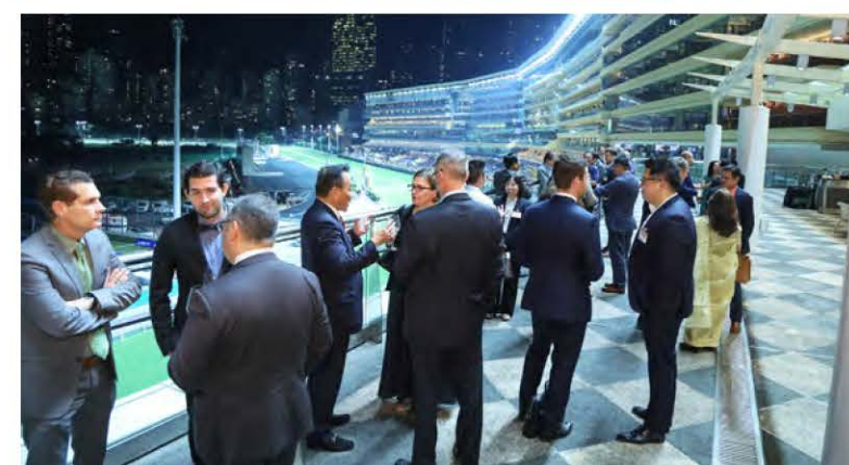
▲ 駐港外國領事、商會代表於“中總盃”活動上歡聚一堂 Foreign consuls in Hong Kong, chamber of commerce representatives gathered together at the “CGCC Cup”