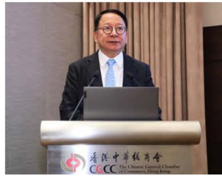
▲ 陳國基 Eric Chan