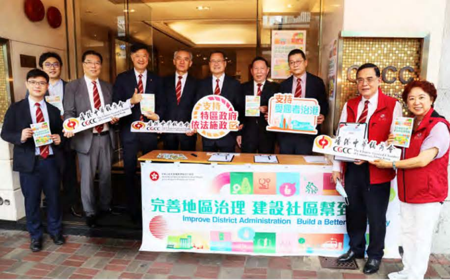
◀ 本會擺設街站收集市民簽名支持完善地區治理建議方案 The Chamber set up a street station to gather signatures from citizens in support of the proposed plan to enhance district governance