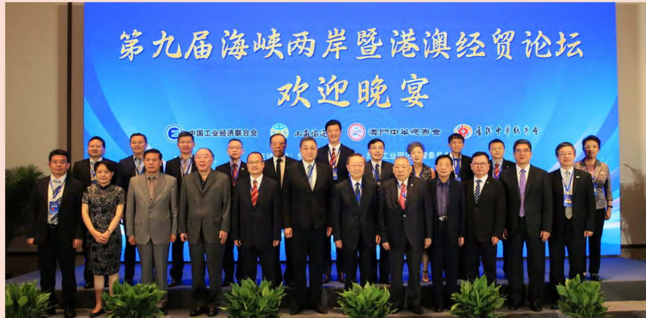
▲ 海峽兩岸暨港澳經貿論壇探討兩岸四地合作新機遇 The Forum on economic ties among the Mainland, Taiwan, Hong Kong and Macao explored new opportunities for cross-strait four regions