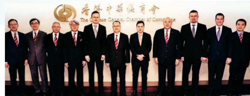
▲ 匈牙利外交及貿易部長 Péter Szijjártó (左五) Péter Szijjártó (fifth from left), Hungarian Minister of Foreign Affairs & Trade