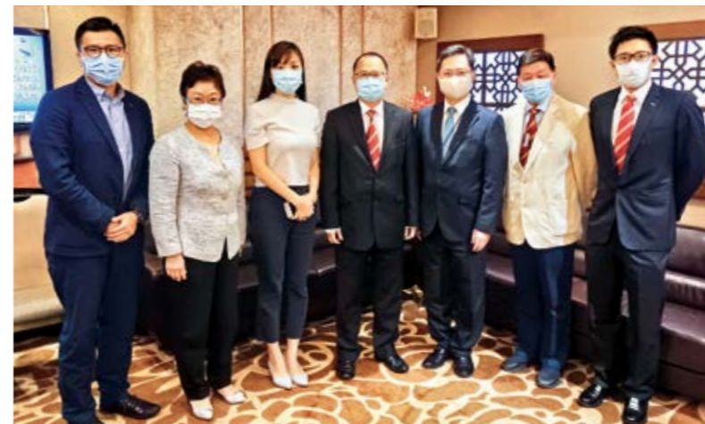
▲ 創新及科技局局長薛永恒 (右三) Alfred Sit (third from right), Secretary for Innovation and Technology