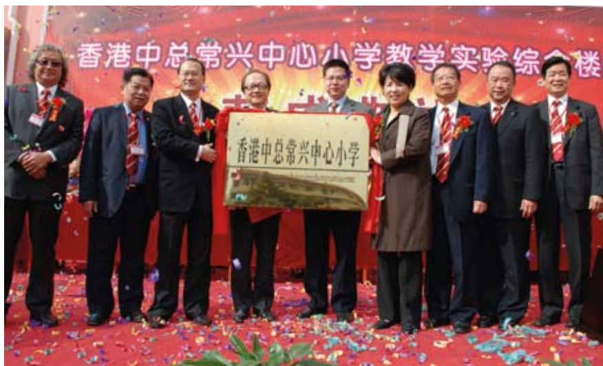
▲ 本會捐建陝西小學教學樓，培育人才。 The Chamber sponsored the construction of the academic building of a primary school in Shaanxi province.